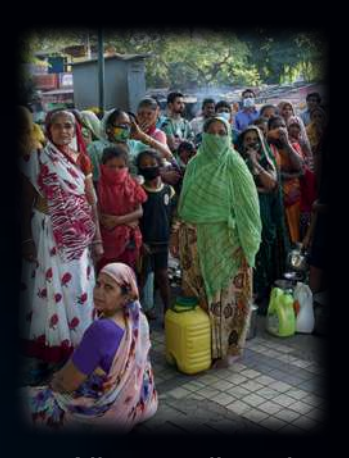
All procedings in support of food projects