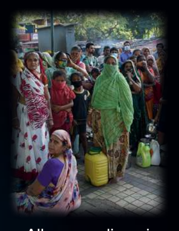
All proceedings in support of food projects