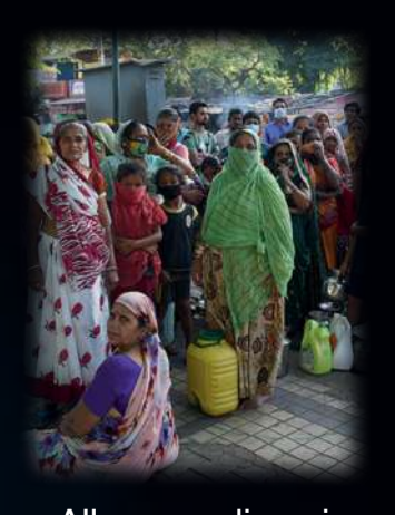
All proceedings in support of food projects