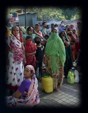
All proceedings in support of food projects