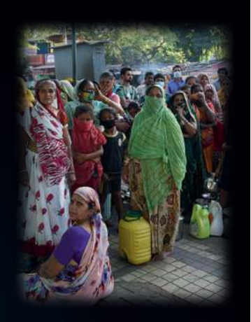
All procedings in support of food projects